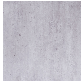
HPL LBL High Pressure Laminate Light Brooklyn