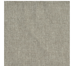
FABRIC 8888 (Premium OLEFIN)