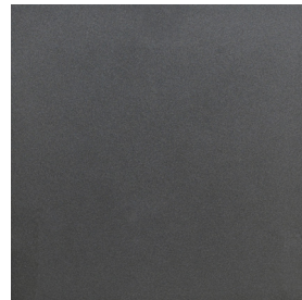
STL GPH Steel Graphite